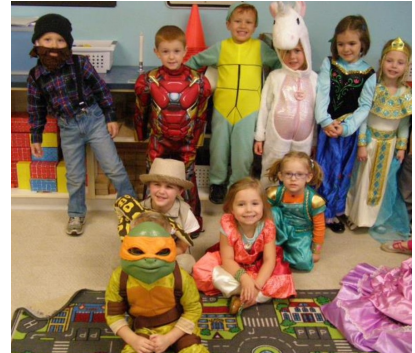
Some 3K-4K students show off their Halloween costumes.

Message from Ms. Haugly: Volunteers are still needed to come and read to the Kindergarten class. (10:15-10:30) Books will be provided or can be brought from home. Come and show how fun reading can be!!!